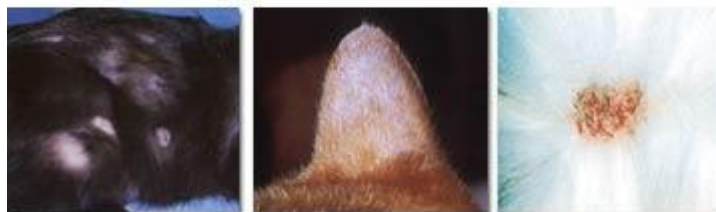
Ringworm lesions in cats

Cats with ringworm may have skin lesions which can appear different depending on where they occur and how long they have been present. The classic symptom is a small round lesion that is devoid of hair. The lesion will often have scaly skin in the center. Small pustules are often found in the lesion. The lesion may start as a small spot and continue to grow in size. The lesion may or may not be irritated and itchy. Lesions are most common on the head, ears, and tail. In some infections, the fungus will not be in a circle and can spread across the face, lips, chin, or nose and look like an autoimmune disease or other generalized skin disease. Occasionally, the infection will occur over the entire body and create a generalized scaly or greasy skin condition. Hair loss may be mild or severe. In some cases the first sign may be excessive shedding, and hairballs may occur when large parts of the body are